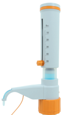
Bottle Top Dispensers Research Model- Fully Autoclavable, Calibration and Accuracy as per ISO 8655