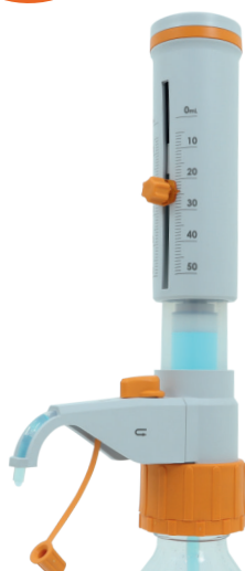
Bottle Top Dispensers Pinnacle Model- with Re-circulation Valve, Calibration and Accuracy as per ISO 8655